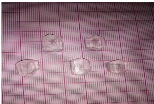
Figure 4.1: Grown L-Alanine doped strontium formate dihydrate crystal

The optimum temperature for the growth of L-Alanine doped strontium formate dihydrate crystals was found to be 40 \text{ }^\circ\text{C} . Crystals of good quality and transparency appeared below the beaker in about 48 hours and grew in large crystals in about 7-8 days. The largest crystal was about 8 mm in length. It is observed that as the size of the crystal increases the transparency was reduced. The photograph of the grown crystals was displayed in fig.4.1.